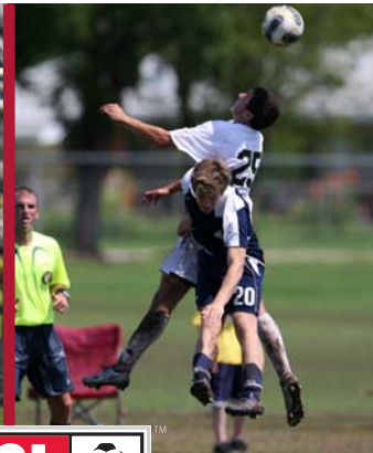
vs. Concorde Fire | '07 USYSA Southern Regional