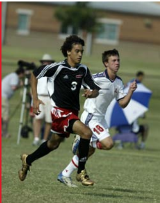
vs. FC Greater Boston Bolts | '05 USYSA Nationals